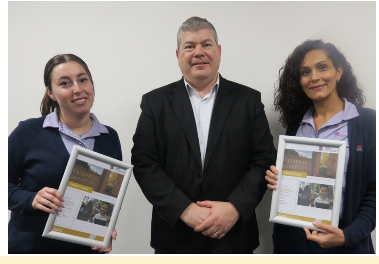
Image 1. Two graduates from the refugee pathway, employed within SWSLHD 2023.